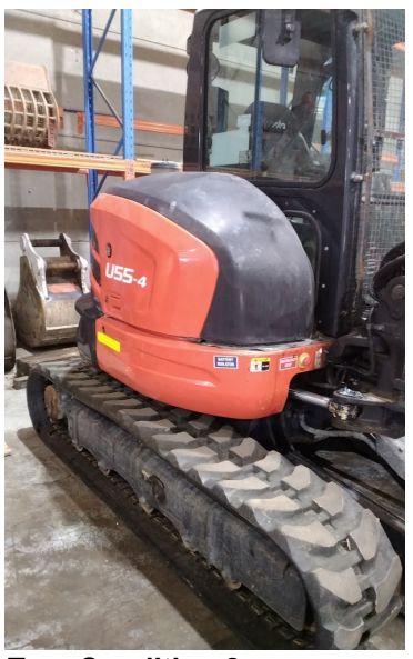
Tyre Condition 2